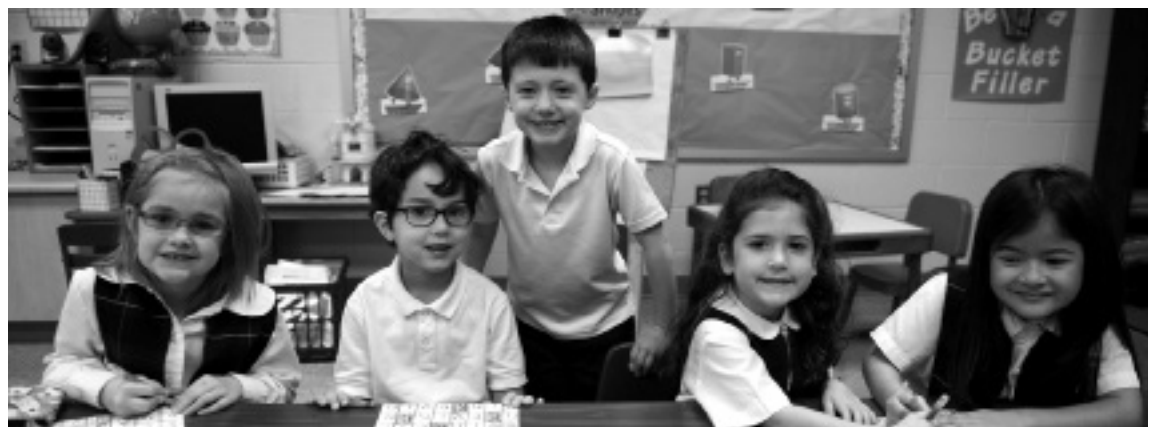
Kindergarteners hard at work.